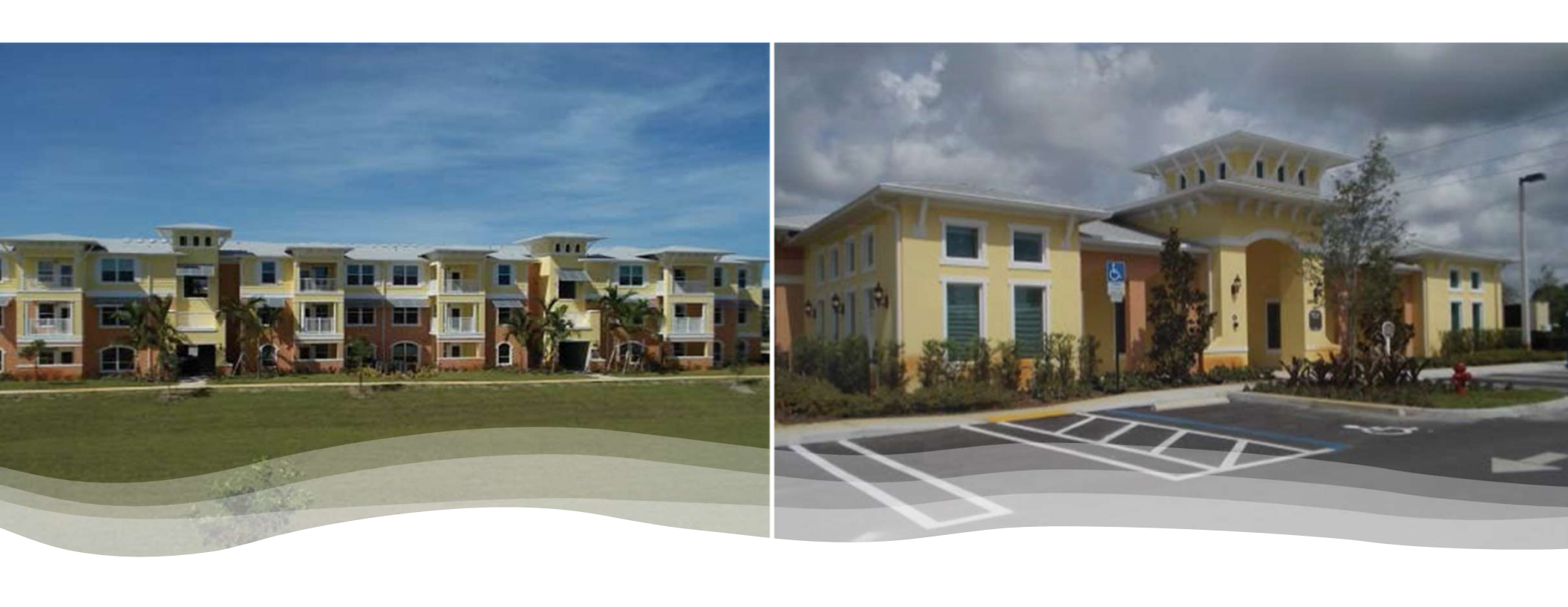
Village Square Villas-Phase 1