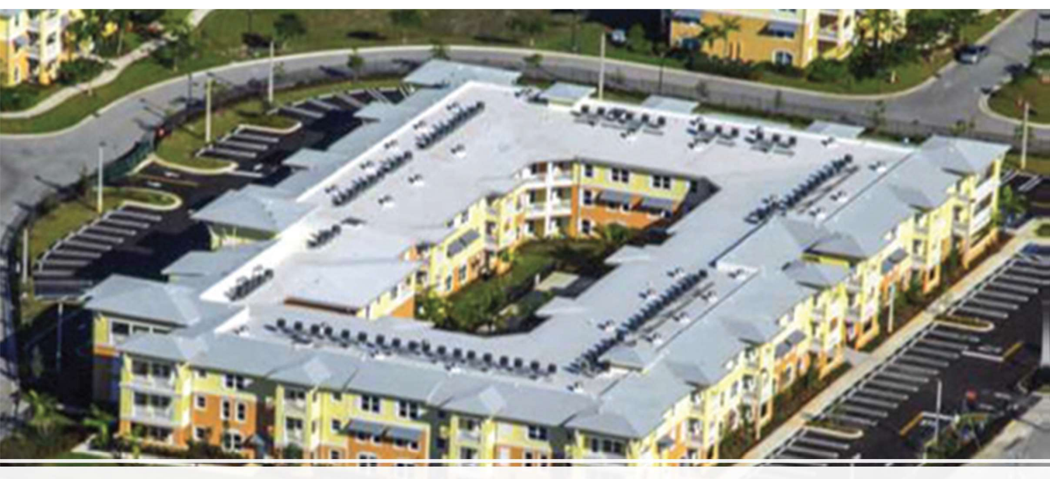
Village Square- The Courts Phase 2